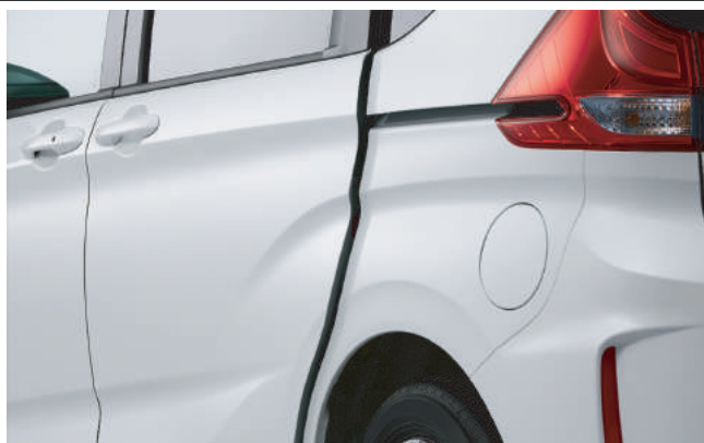
Power Sliding Door