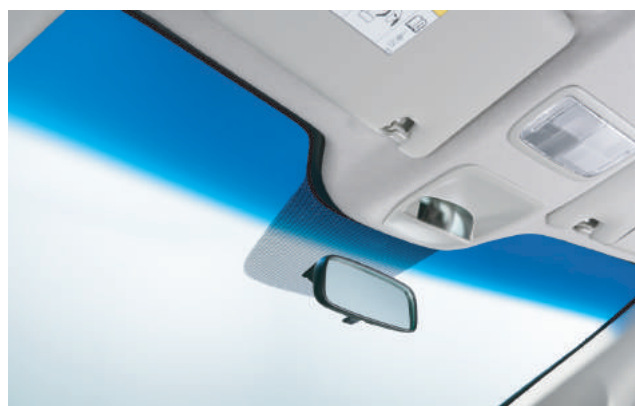
Half Shade Front Windows