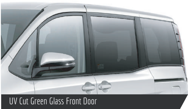
UV Cut Green Glass Front Door