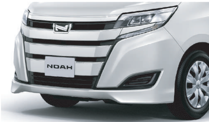
Front Grill (Coloured + Plated Mould)